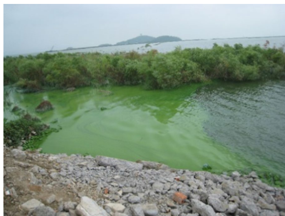
Fig. 1 Cyanobacteria outbreak in Taihu Lake, China

The diffusivity of N and P differs greatly in soils. Cookson et al. have reported that the diffusion coefficient of \text{H}_2\text{PO}_4^- in soils was only one thousandth of that of \text{NO}_3^- to affect the rate of runoff losses in N and P [29]. In a cropland fertilized with 196 \text{ kg N ha}^{-1} \text{ year}^{-1} and 87 \text{ kg P ha}^{-1} \text{ year}^{-1} , N and P fertilizer runoff loss rates were 9.5% and 3.3%, respectively [30]. In contrast, in paddy soils fertilized with 210 \text{ kg N ha}^{-1} \text{ year}^{-1} and 36 \text{ kg P ha}^{-1} \text{ year}^{-1} , N and P fertilizer runoff loss rates were 5.9% and 0.52%, respectively [31]. In this case, the N and P discharge rates were estimated as 12.39 and 0.18 \text{ kg ha}^{-1} \text{ year}^{-1} , respectively. Although the loss load of nutrients varies little from year to year, it varies greatly from month to month. For instance, the highest N and P loss concentrations took place over April, June, July, and August in China, which correspond to the high-risk eutrophication period [32]. The unevenness of time distribution of loss load